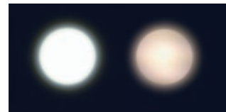
LED VS. HALOGEN

By utilising 5,500K white Light Emitting Diodes (LEDs) as opposed to halogen lamps, the Green Series Medical Exam Lights will provide you with a superior, white light that is significantly brighter than halogen, resulting in an overall improved exam by allowing for enhanced visualization of the examination area, true tissue colour rendition, and a uniform spot—no dark or hot spots. And our white LEDs have industry-leading lumen performance and 50,000 hours of life.