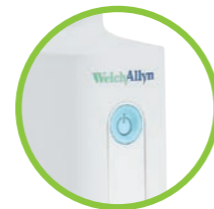
All lights feature touchless controls

This procedure light, featuring six LEDs, combines outstanding durability, extraordinary manoeuvrability, unparalleled spot quality and multiple mounting options. The ceiling mount option gives caregivers the ability to maximize floor space and direct light wherever it is needed during a procedure. And with minimal heat output and high colour temperature, the GS 900 is the perfect low-maintenance, top-performing light for nearly every application in the hospital or GP surgery.